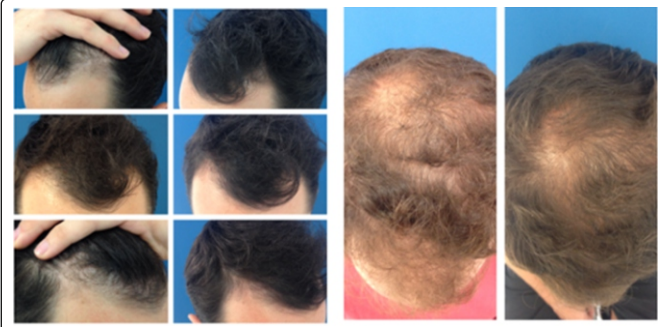
Figure 2: pre and post pictures. Left: case 1 (Day 0 top - Day 30 bottom). Right: case 2 (Day 0 left - Day 30 –right).